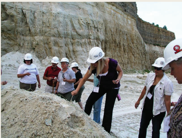
Tours provide opportunities to explore to see and touch rocks, as well as collect samples for use in the classroom

“I cannot begin to tell you how much I appreciate the hard work and dedication you all put into this workshop. Teachers spend a lot of out-of-pocket money to purchase teaching materials, etc. This workshop has provided a wealth of treasures for us to use in the classrooms! I have learned much about mining this week and will use my knowledge to inform my children about our great natural resources.”